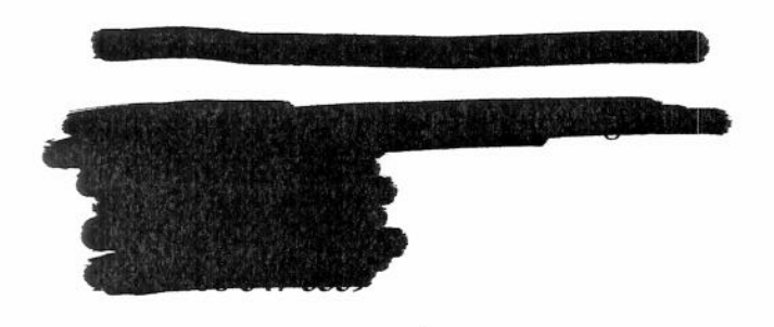
With a copy to:

ICS Attorney Suite 4300 675 West Peachtree Street Atlanta, GA 30375